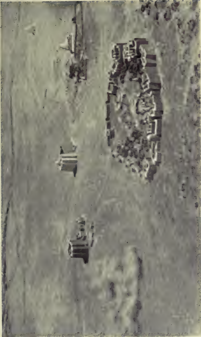
"AT 1,000 FEET." BOMBS BURSTING N.W. OF TALE.